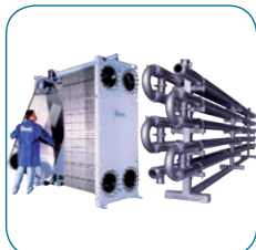
Varmevekslere / Heat exchangers