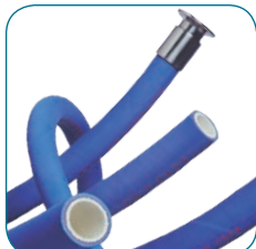
Slanger / Hoses