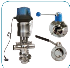
Ventiler / Valve