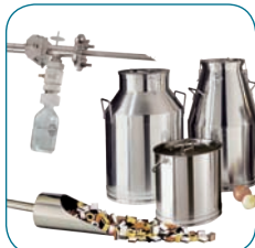
Andre produkter / Other products