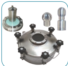
Tankudstyr / Tank Equipment