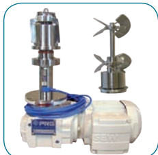
Røreværker / Mixer