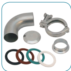
Fittings / Fittings