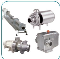
Pumper / Pumps