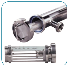
Flow komponenter / Flow components